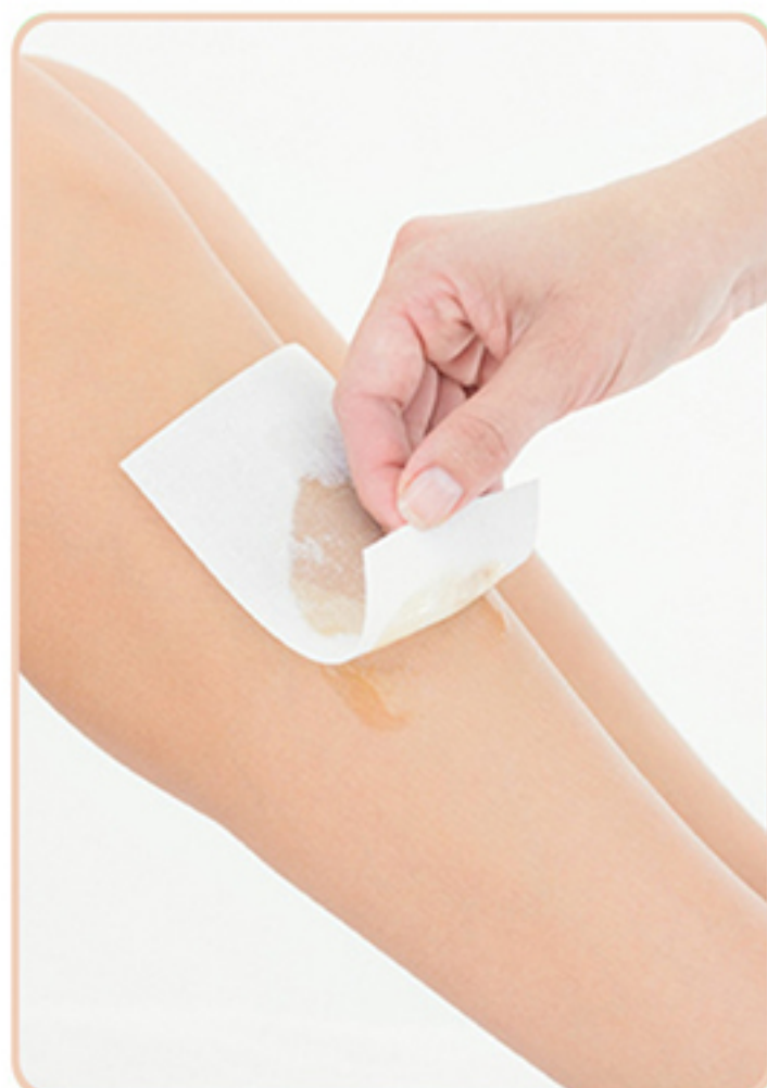
Beeswax hair removal Unbearable pain