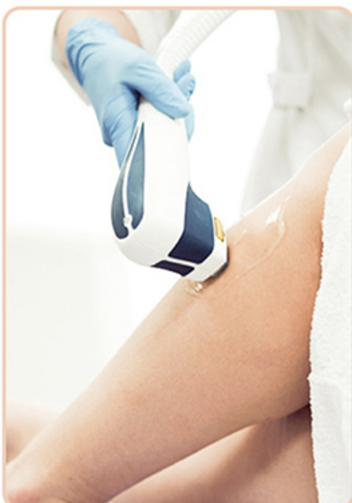
Hair removal in beauty salon Expensive and time consuming