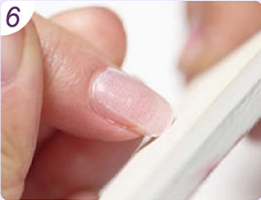
Use a strip of yarn to grind off the excess silk around the nail and finish.