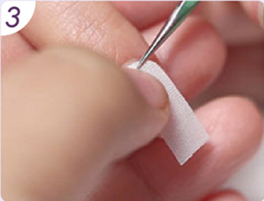
Cut shapes along the marks and glue them to your nails