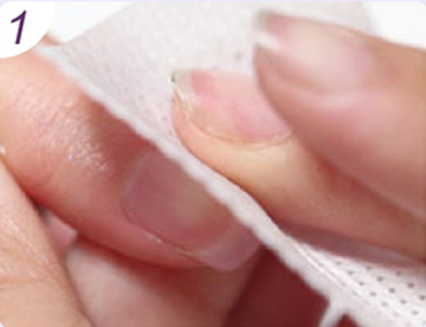
Polish the nail with yarn to clean the nail surface