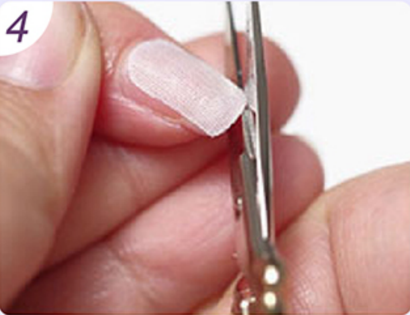
Cut the excess along the edge of the nail