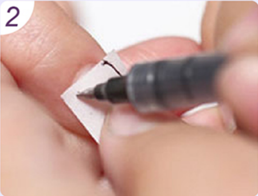
Use a pen to draw lines of the desired size