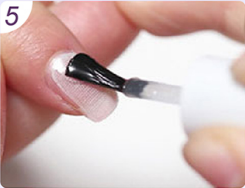
Using the glue used to stick nail pieces, apply a layer of glue to the silk and let dry