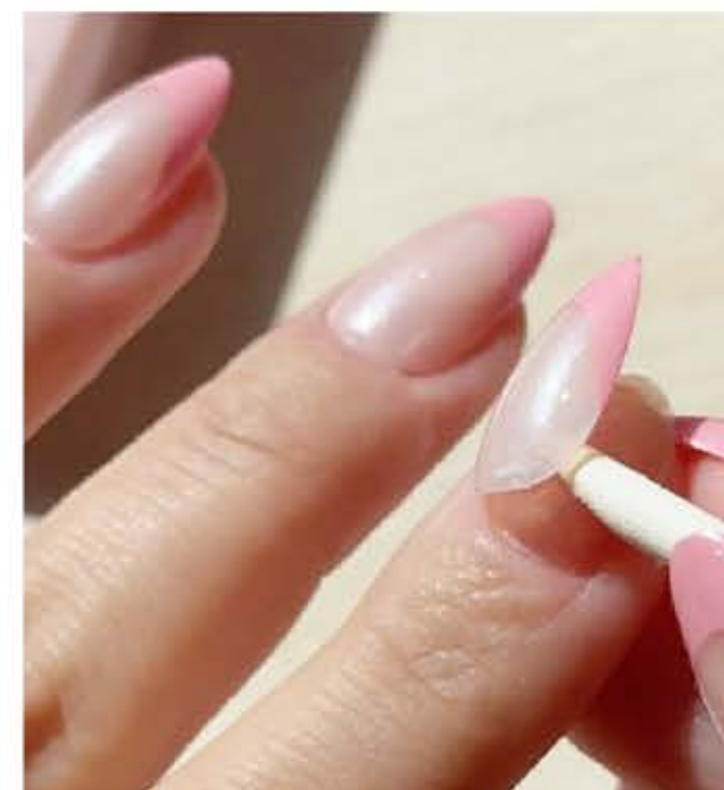
Step 3: Lift