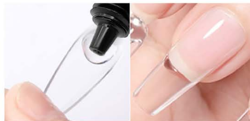
Versatile for nail extensions