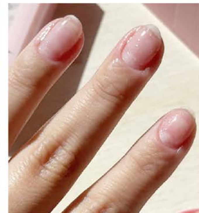
Step 4: Clean