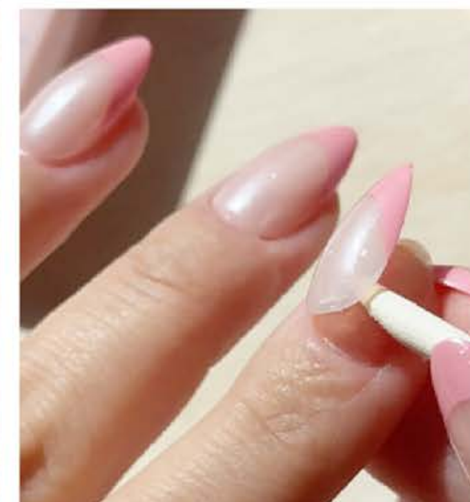
Step 2: Drop