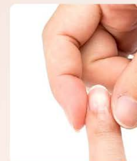
Step 4: Massage it in to maximum the effects of your cuticle oil