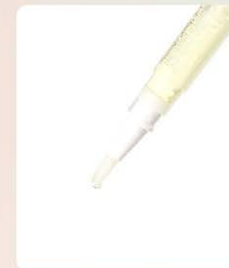
Step 2: Rotate until oil comes out