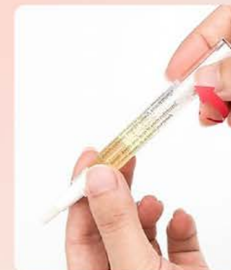
Step 1: Rotate the tube clockwise