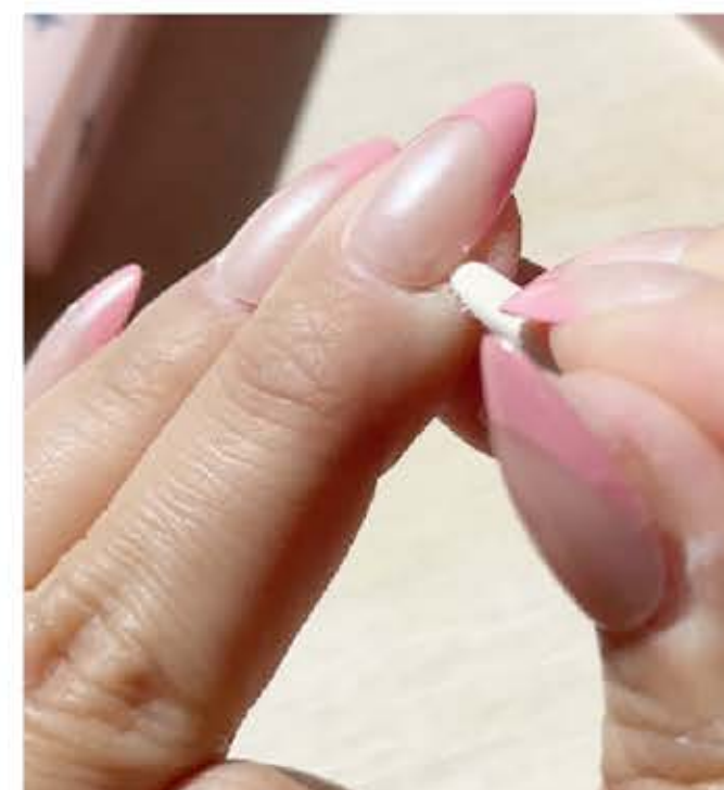
Step 1: Push

SKU.NO.: 101270436 Material: Glass, latex Capacity: 30ml