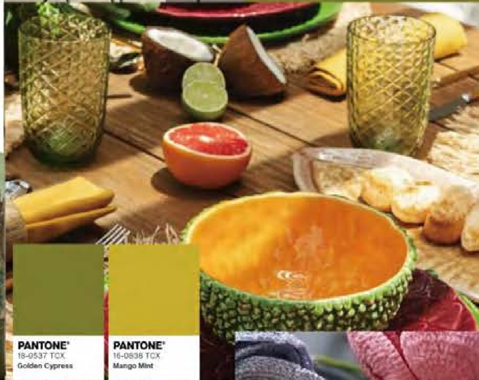
PANTONE® 18-0537 TCX Golden Cypress