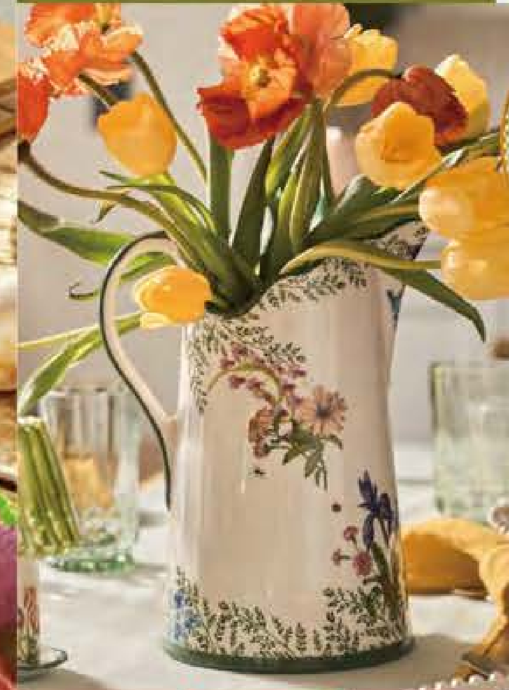
PANTONE® 16-1422 TCX Cork