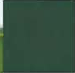
PANTONE® 19-5920 TCX Pineneedle