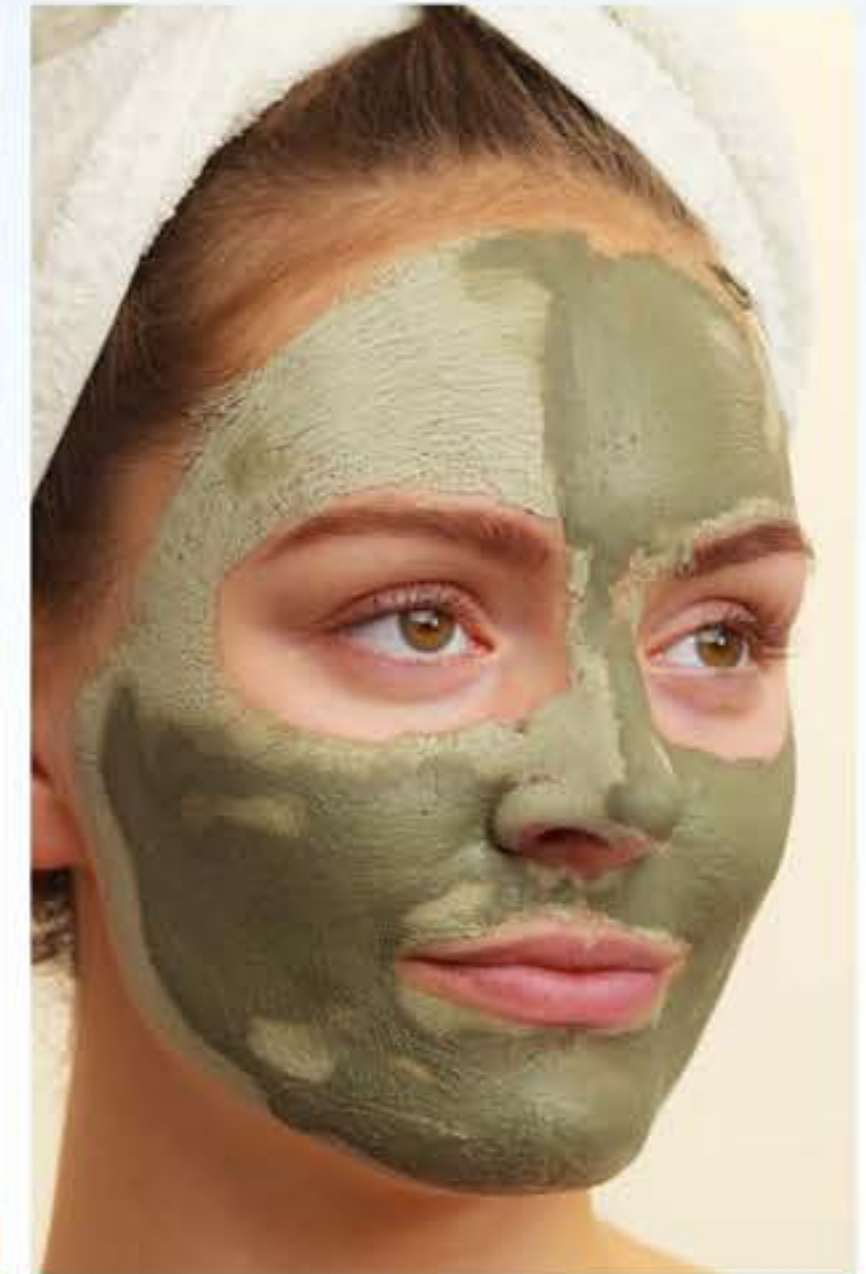
FACE MASK CLEANSING