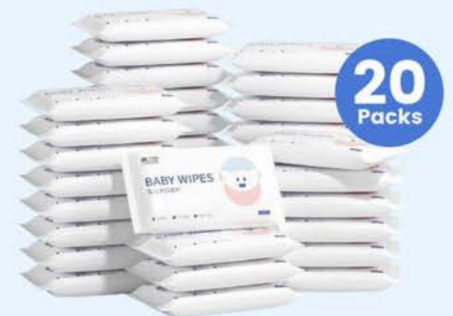
10 wipes × 20 packs 【or Customized】