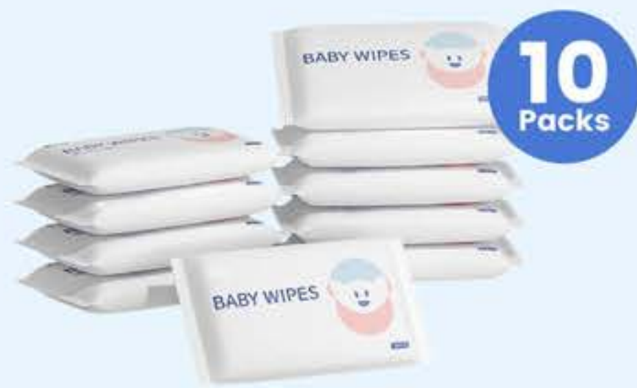
10 wipes × 10 packs 【or Customized】