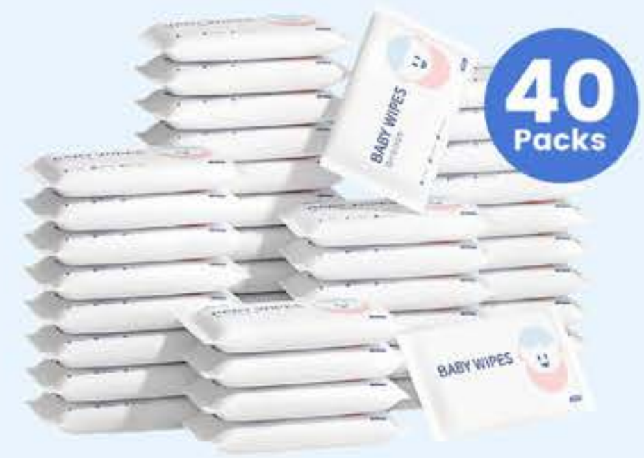
10 wipes × 40 packs 【or Customized】